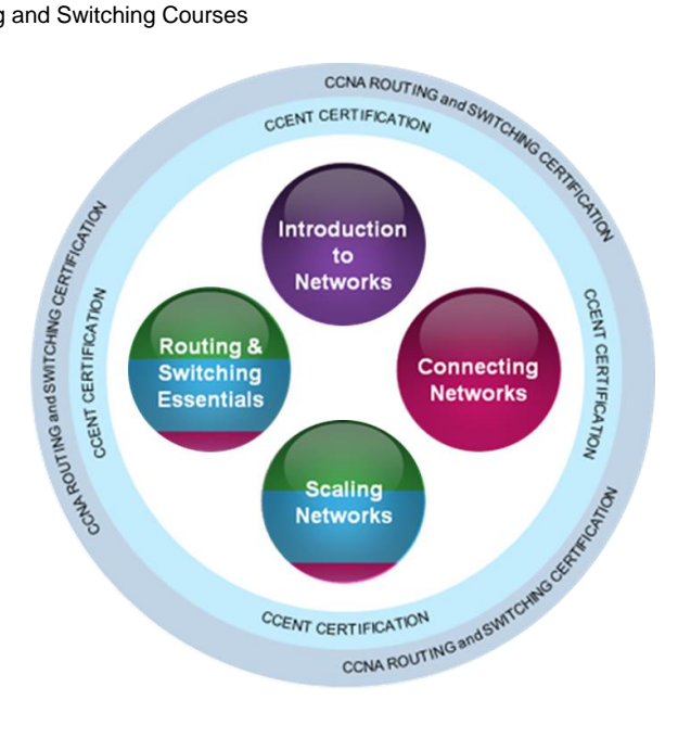
Figure 1. CCNA Routing and Switching Courses

The CCNA Routing and Switching curriculum consists of four courses that make up the recommended learning path. Students will be prepared to take the Cisco CCENT® certification exam after completing a set of two courses and the CCNA Routing and Switching certification exam after completing a set of four courses. The curriculum also helps students develop workforce readiness skills and builds a foundation for success in networking-related careers and degree programs. Figure 1 shows the different courses included in the CCNA Routing and Switching curriculum.